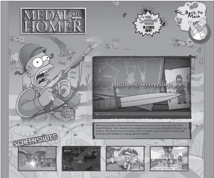
Fig. 1.2. An online ad for The Simpsons Game parodies the Medal of Honor franchise, complete with its nostalgic documentary-style cut sequences.

Nor are they alone in this regard, as The Simpsons' history, and many of its public meanings, has often relied heavily upon its paratexts. While above I suggest that the paratexts were viable parts of the text, at times the show's paratexts have done more to create the text as it is known than has the show itself. In particular, we might look at the furor that surrounded the show in its early years, directed primarily at Bart as irreverent youth, but one that centered on—and was in many ways ignited by—the mass popularity of t-shirts labeling Bart an “Underachiever,” while he responds, “And Proud of It, Man.” Many parents, teachers, principals, and pundits around the United States worried about children learning a slacker attitude from the t-shirt's sentiment, and as a result, many schools banned the t-shirts, and conservative rhetoric and complaints swarmed around the show. 12 This rhetoric completely failed to realize the sly message in the t-shirt: as Laurie Schulze notes, “Bart has managed to turn the tables on the system that's devalued him and say, ‘In your face. I'm not worthless,